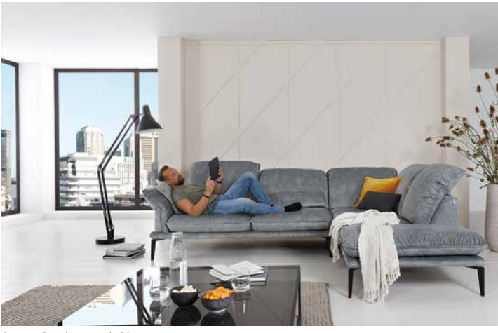
Cover: S41/25 steel, SB armpart