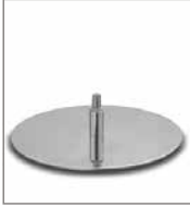
turntable high-gloss chrome