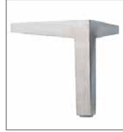
metal leg, gloss