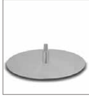
turntable matte chrome look