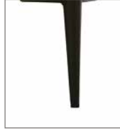
metal leg different metal colours